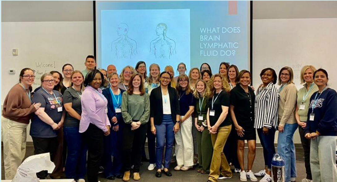
Pre-conference Training Session for Certified Lymphedema Therapists