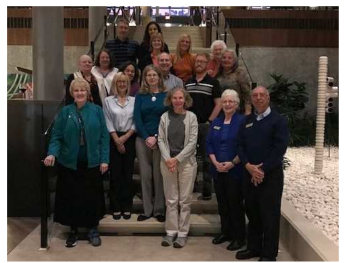
Attendees at our Friday night speakers' dinner