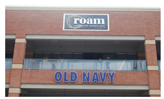
The Roam facility

Once again, we offer our sincere thanks to Peyton and Vicky Day for opening the excellent ROAM facility for us to use, and for the incredible support staff. We received many nice accolades; the ROAM seemed so comfortable and the attendees appreciated the program with very positive comments about the speakers and the presentations. ("Excellent presenters! Dynamic speakers! Most interesting! Overall program was awesome, thanks! Conference was exceptional! Really enjoyed the patient stories!")